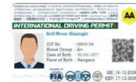
IDP Card - Back