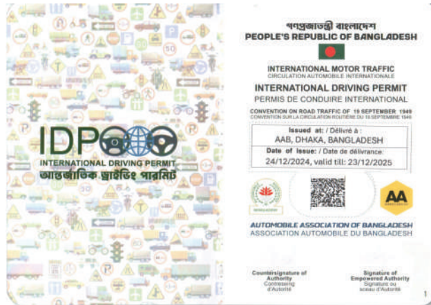
Inside - Dates & QR

By scanning the QR code your IDP can be verified through aabverify.online